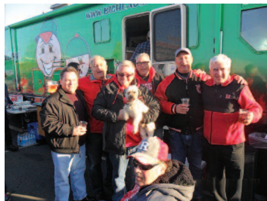
Enjoying our alumni tailgate prior to the Rutgers Spring Football Game on April 24th.