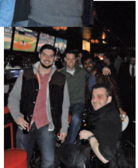
The event was held at Huey's Knight Club on April 10th.